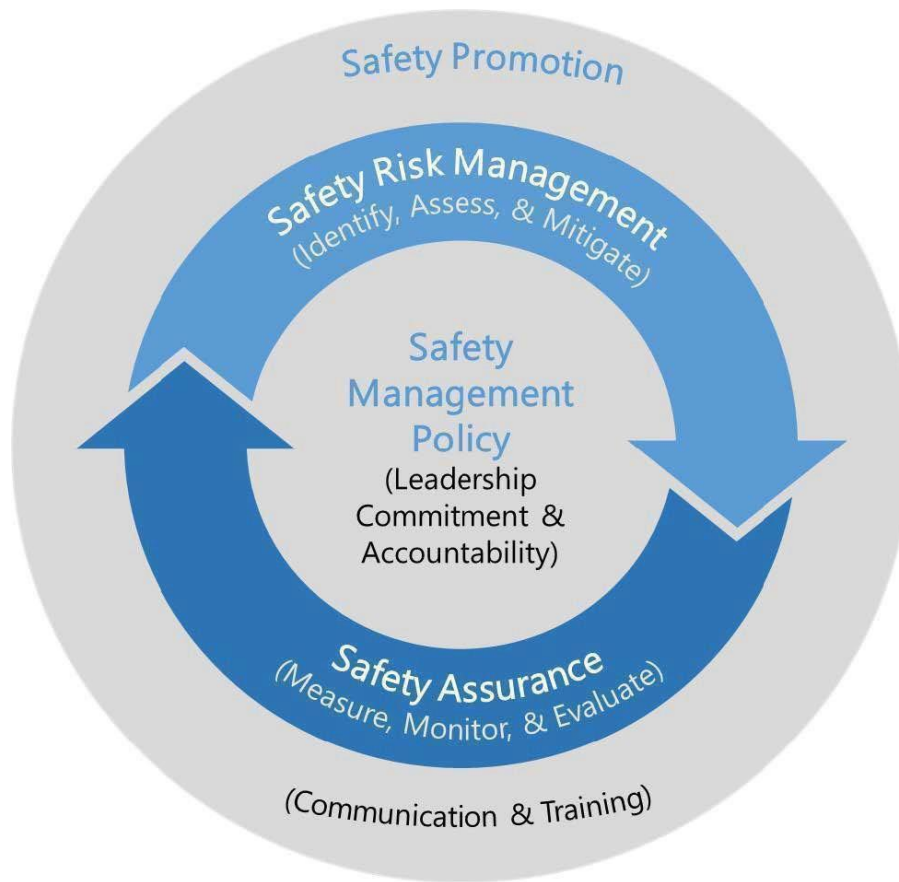
FIGURE 2: SAFETY MANAGEMENT SYSTEMS

Implementing SMS at El Metro will be a major undertaking over the next several years. This ASP is the first step to putting in place a systematic approach to managing the agency’s risk. El Metro has already taken several steps to implement SMS, such as developing this initial ASP and designating a CSO. During the first year of implementation, El Metro will identify SMS roles and responsibilities and key stakeholder groups, identify key staff to support implementation, and ensure the identified staff receive SMS training. El Metro will also develop a plan for implementing SMS, inform stakeholders about the ASP, and discuss our progress toward implementation with the City of Laredo, the Laredo Mass Transit Board and our agency’s planning partners.